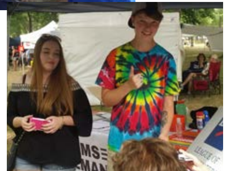
Pride Fest visitors to the LWV-RMA information table.