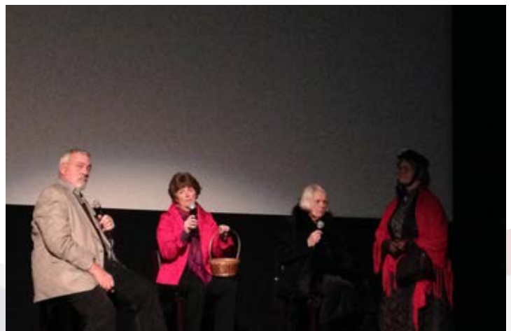
Q/A Forum following SBA House Suffragette movie - November 22nd

On Wednesday, February 10, you're cordially invited to celebrate Susan B. Anthony's birthday! The annual luncheon will be held at the Riverside Convention Center beginning at 11:30 AM; the theme is "Making History" and the guest speaker is Billie Jean King. Tickets are $75. Please reserve your place at the League's table by registering at www.lwv-rma.org .